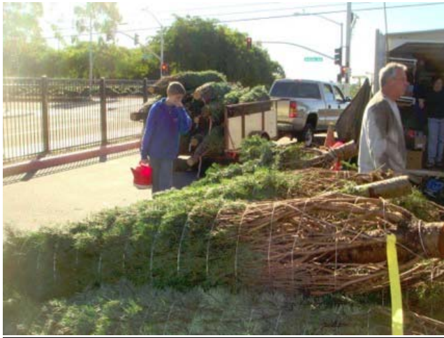
Pictured: Volunteers and members of Scout Troop 105 unloading Christmas Trees and setting up the booth for Christmas tree sales