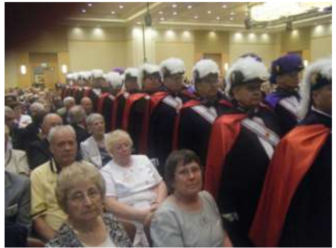
Parade of SKs on the hotel ballroom floor.