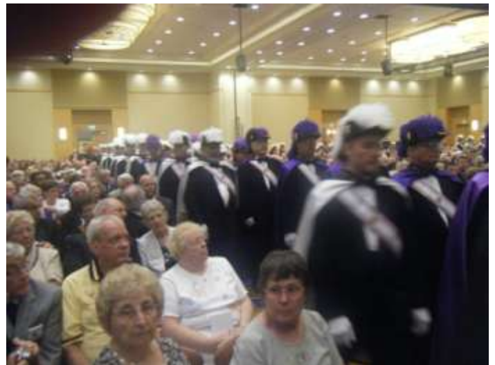
Parade of Corps Commanders and Navigators on the ballroom floor.