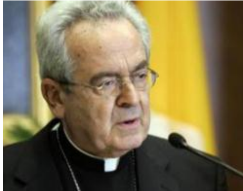
Pictured: Cardinal Justin Rigali, Archbishop of Philadelphia, Chairman, USCCB Committee on Pro-Life Activities.

An internecine battle broke out as the last week of July came to an end in Washington, D.C. It is a matter of life and death, truth or deception.