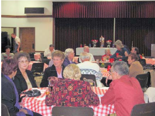
Various parishioners socialize at the St. Joseph's dinner.