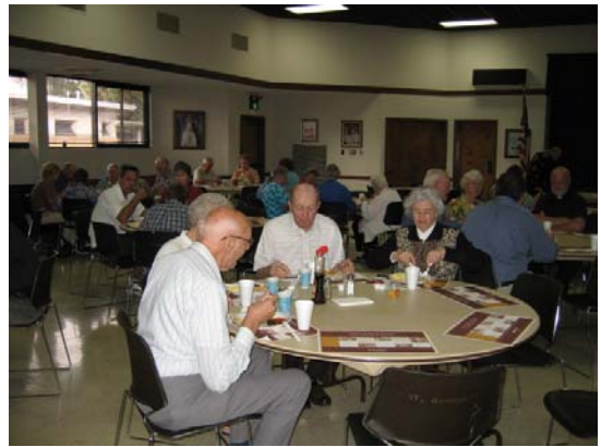
Various parishioners enjoy their pancake breakfast.