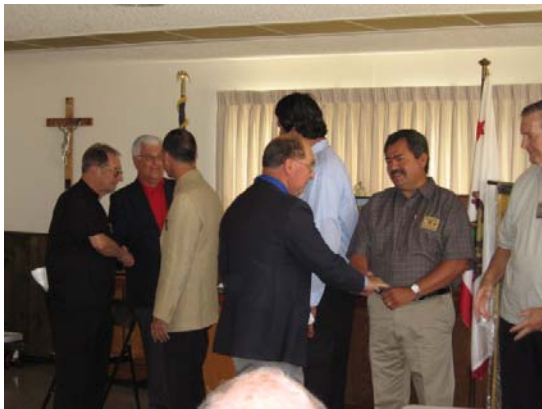
The new officers congratulate each other after the installation.