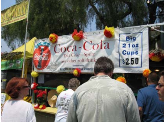
Customers line up to buy their drinks.

Pancake Breakfast & Blood Drive, August 12, 2007