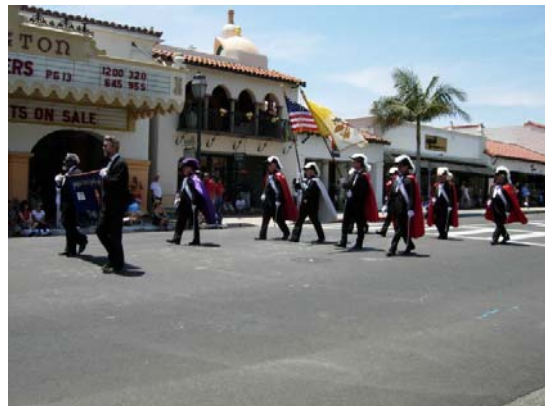
The Color Corps march in front of the Arlington Theatre.