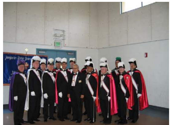
The Color Corps pose for their picture before the certification ceremony that followed the installation.