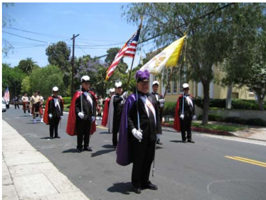
The Color Corps is ready to march down State Street in the Fourth of July Parade.