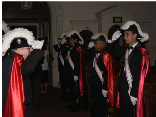
Color Corps saluting Confirmation students along with their families, friends and clergy at Our Lady of Sorrows.