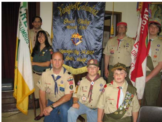
The Boy Scouts pose for their picture in front of the KC 5300 banner