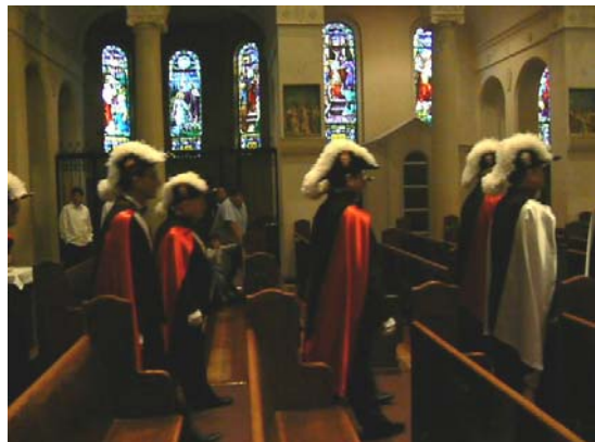
Color Corps marching into Our Lady of Sorrows church at the start of Confirmation ceremonies.