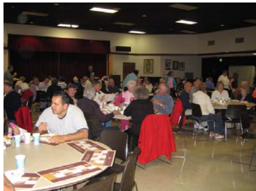
Parishioners enjoying dinner and conversation at Fish Fry.