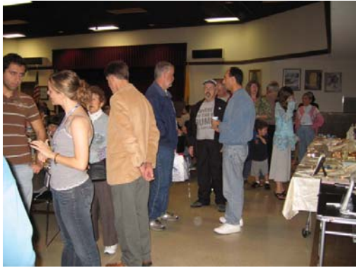
Parishioners line up to be served.