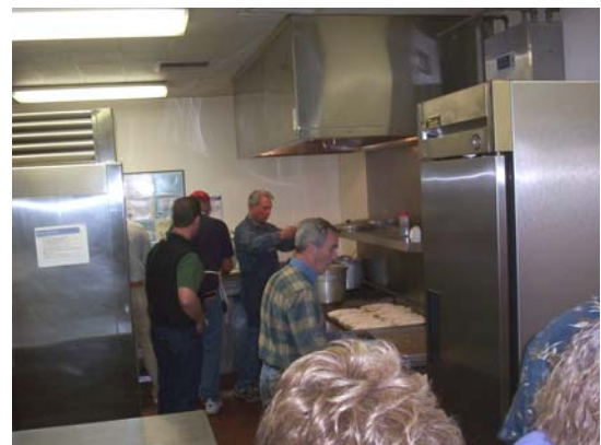
A picture of the kitchen crew at the February 23 rd Fish Fry.