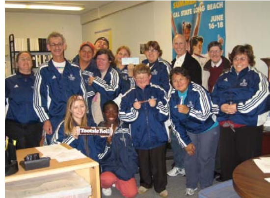
Other board members of the Special Olympics group in Santa Barbara.