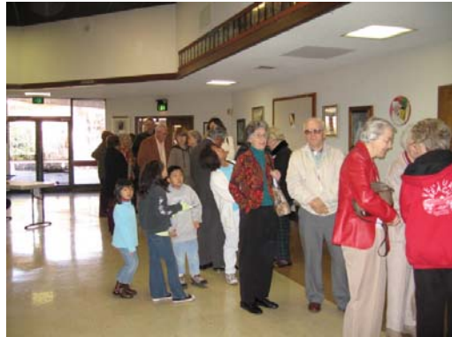
Parishioners from 9:30 mass lined up for breakfast.