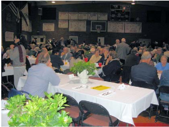
Pictured above are many of the guests who attended the dinner.