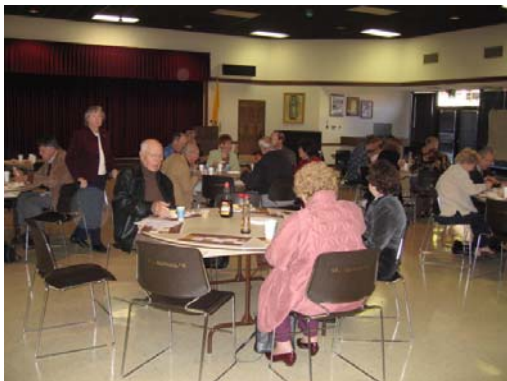
Parishioners enjoying breakfast.