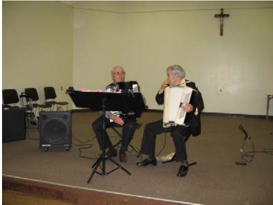
The two accordionists hard at work.