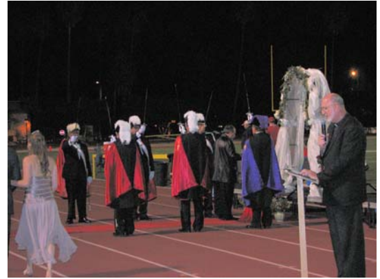
The Color Corps stand at the Present Sword position alongside the Homecoming Red Carpet.