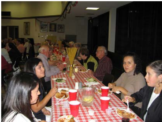
Various parishioners enjoy their meal.