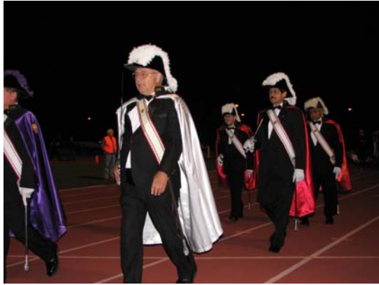
The Color Corps march in front of the Bishop Diego Homecoming party.