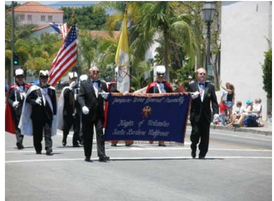
The Color Corps march down State Street.