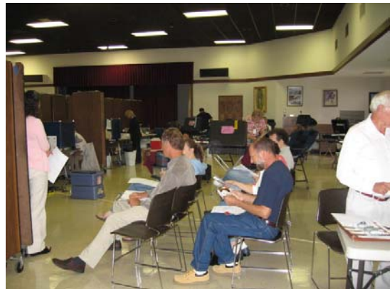
Another picture of several blood donors waiting to give their blood.