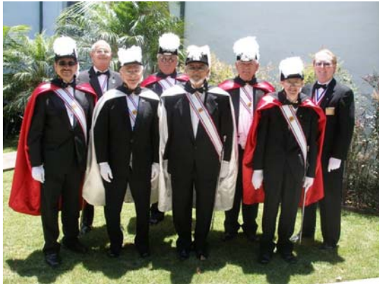
Some of the members of the 4 th degree Color Corps pose for their picture prior to the July 4 th march down State Street in the 4 th of July parade.