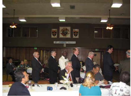
The various officers to be installed line up at the beginning of the ceremony.