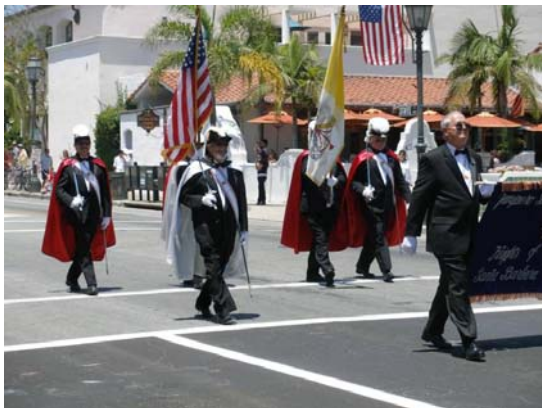
Another picture of the marchers.