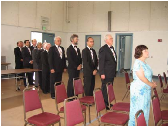
The new 4 th Degree officers to be installed stand in formation just prior to the ceremony.