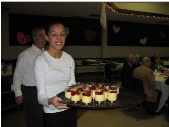
A picture of the wonderful dessert: "Cherry Delight".