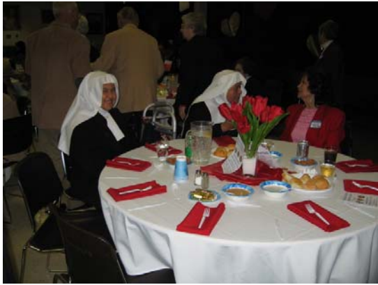
A picture of one of the many religious orders that attended the event.

Pictures from the Clergy Appreciation Dinner at St. Raphael's Hall-February 15, 2006