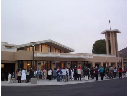
A picture of the front of St. Mary's Church-Palmdale on the day of the dedication.

Pictures from the Dedication of St. Mary's Church-Palmdale, December 8, 2005 and the new picnic area behind St. Raphael's hall