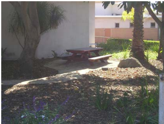
A view of the new picnic bench and picnic area installed by Eagle Scout Michael McClenathen.