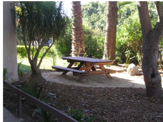
Another view of the picnic area and bench.